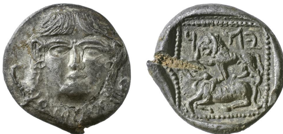
The jewel of the crown of the Israel Museum collection – a unique quarter Sheqel with the Aramaic legend yhd.

This is the earliest coin minted in Judah during the late Persian Period (ca. 400 BC).