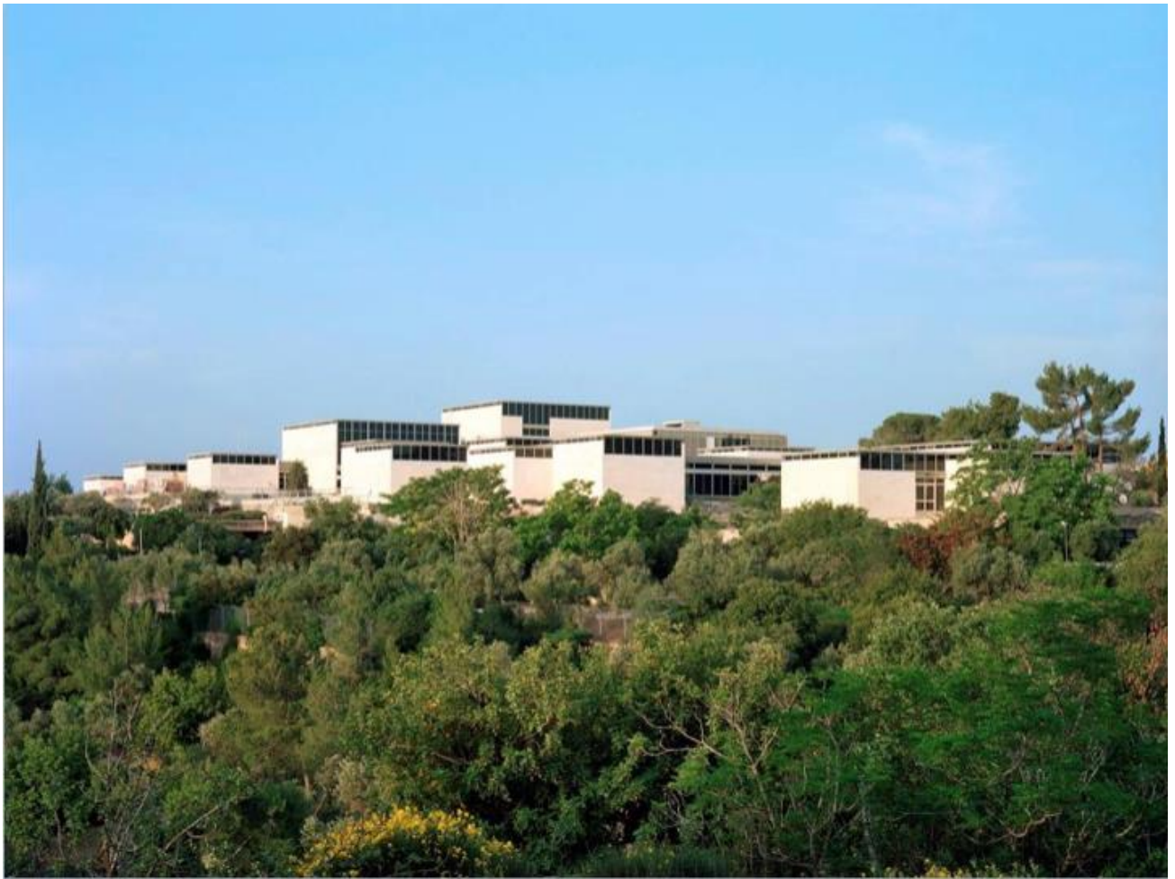
Eastern view of the Museum