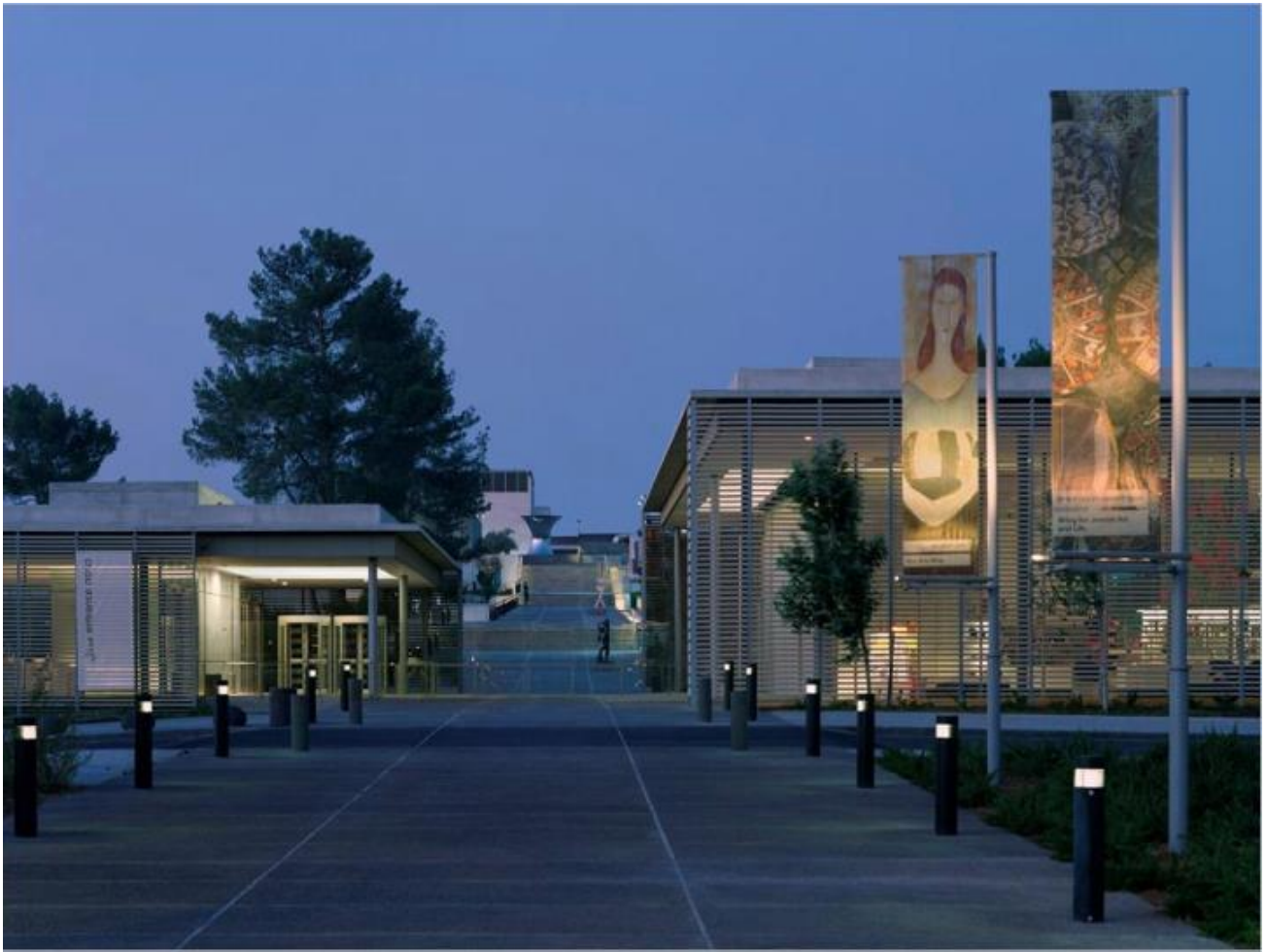
Main entrance to the Israel Museum

The Israel Museum is the largest cultural institution in the State of Israel and is ranked among the leading art and archaeology museums in the world. Founded in 1965, the Museum houses encyclopedic collections ranging from prehistory through contemporary art and includes the most extensive holdings of Biblical and Holy Land archaeology in the world, among them the Dead Sea Scrolls. Over its first 50 years, the Museum has built a far-ranging collection of nearly 500,000 objects through an unparalleled legacy of gifts and support from its circle of patrons worldwide.