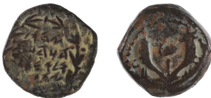
The first coin recorded in the Israel Museum Numismatic Collection: A Hasmonean prutah of Judah Aristobulus (Yehudah), 104-103 BCE, IMJ Inventory No. 71.1

The holdings of the Numismatic Department are based primarily on generous donations from the following sources: