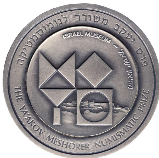
The Ya'akov Meshorer Numismatic Prize medal

Today, our collection includes 35,054 items, among these: