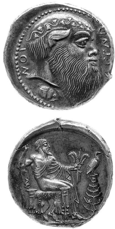
The Coin of Coins: A World Premier, Spring - Fall 2004 The Aitna tetradrachm, ca. 465-460 BCE

In 2012, the exhibition White Gold: Revealing the World's Earliest Coins ( http://www.imj.org.il/exhibitions/2012/WhiteGold/ ) presented an assemblage of 500 electrum coins, the largest group of this coin-type ever shown to the public in one show. This exhibition was complemented by an international numismatic congress, which hosted the 19 leading scholars in the field from around the world.