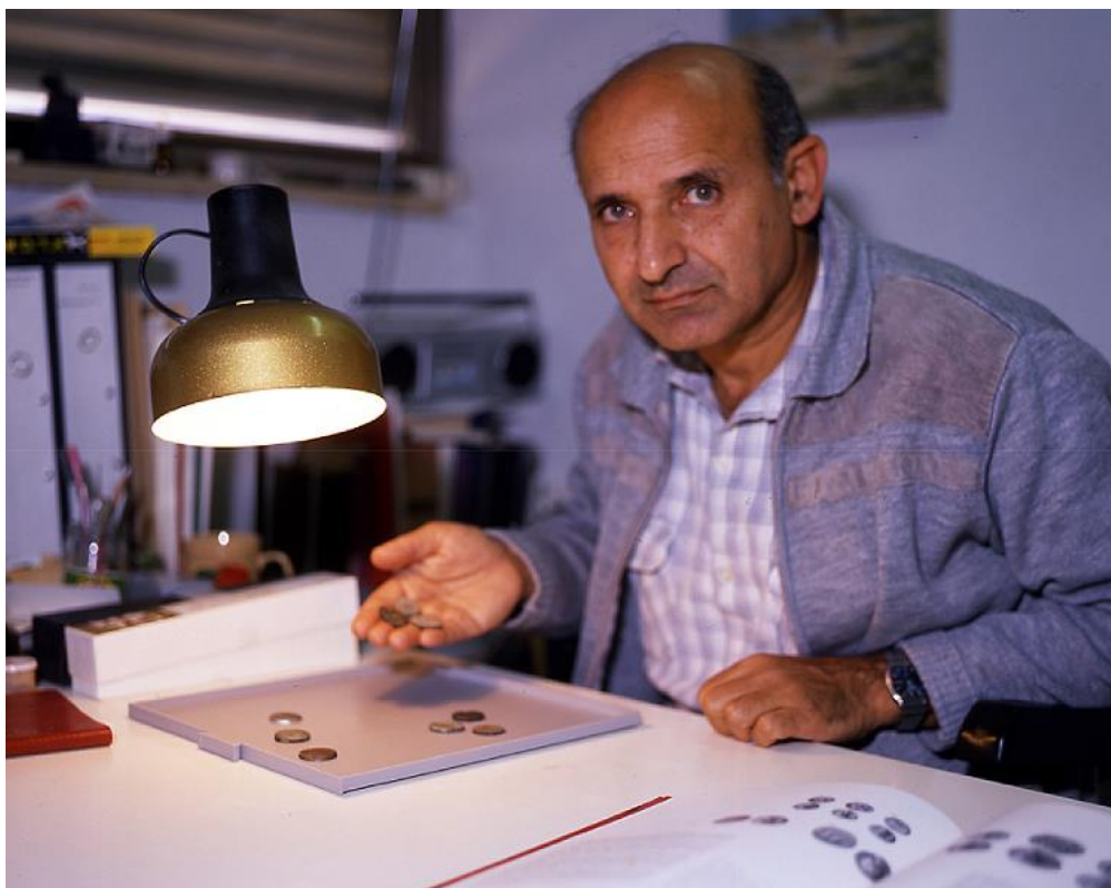
Prof. Ya'akov Meshorer, founder of the Israel Museum Numismatic Department

Prof. Meshorer built the Israel Museum's coin collection from scratch and systematically assembled its coins within a relatively short period of time in comparison to other public collections. While most of the Museum's archaeological departments rely on excavated finds on loan from the Israel Antiquities Authority, Meshorer realized that he would have to adopt a different approach, as most coins discovered in excavations survive in relatively poor condition and are therefore unsuited to museum needs. He thus sought out private collections with choice exemplars of representative coins, and over the years, succeeded in acquiring many of these coins for the Israel Museum and in assembling a large and impressive collection. Prof. Meshorer headed the department until 1993, when I succeeded him.