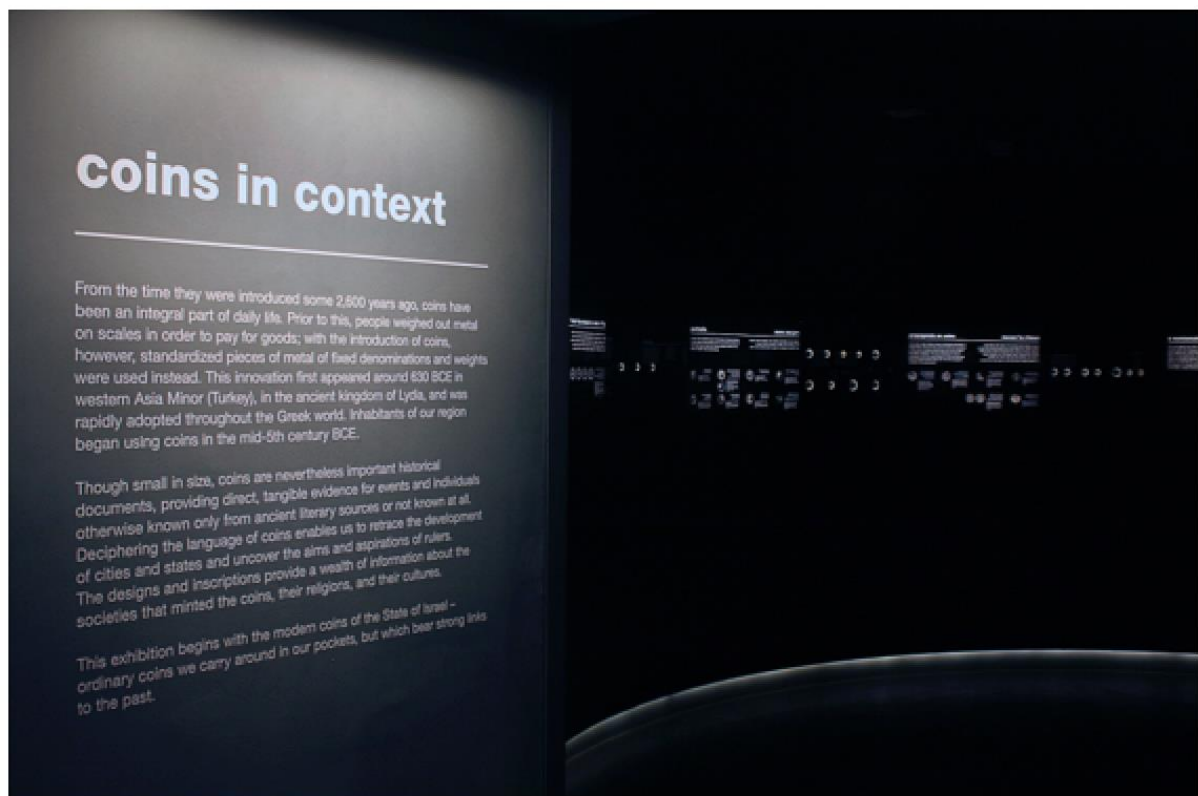
The entrance to the Coin Gallery at the Israel Museum

Important temporary exhibitions presented over the years include: Imaginative Coins and Fantasy Shekels ; The Production of Coins in the Ancient World ; Coins of Israel, Old and New (in cooperation with the Bank of Israel); City Coins of Eretz Israel and the Decapolis ; and The Coins of Aelia Capitolina - Roman Jerusalem .