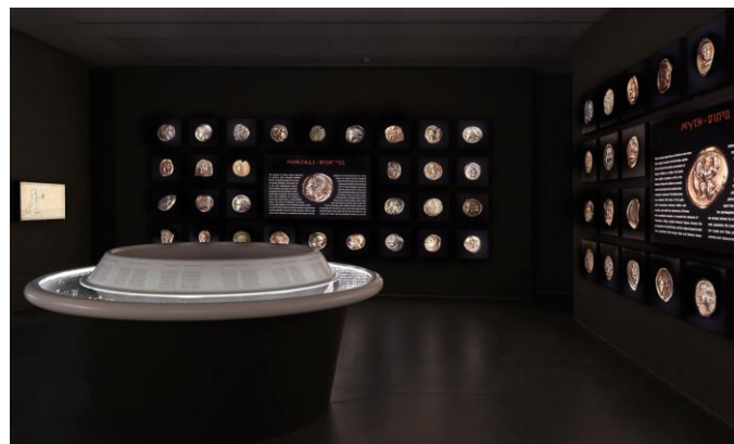
View of the temporary exhibition, White Gold: Revealing the World's Earliest Coins

In 2012, the exhibition White Gold: Revealing the World's Earliest Coins ( http://www.imj.org.il/exhibitions/2012/WhiteGold/ ) presented an assemblage of 500 electrum coins, the largest group of this coin-type ever shown to the public in one show. This exhibition was complemented by an international numismatic congress, which hosted the 19 leading scholars in the field from around the world.